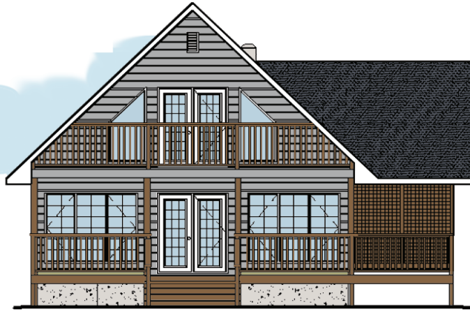
Some features shown may be optional