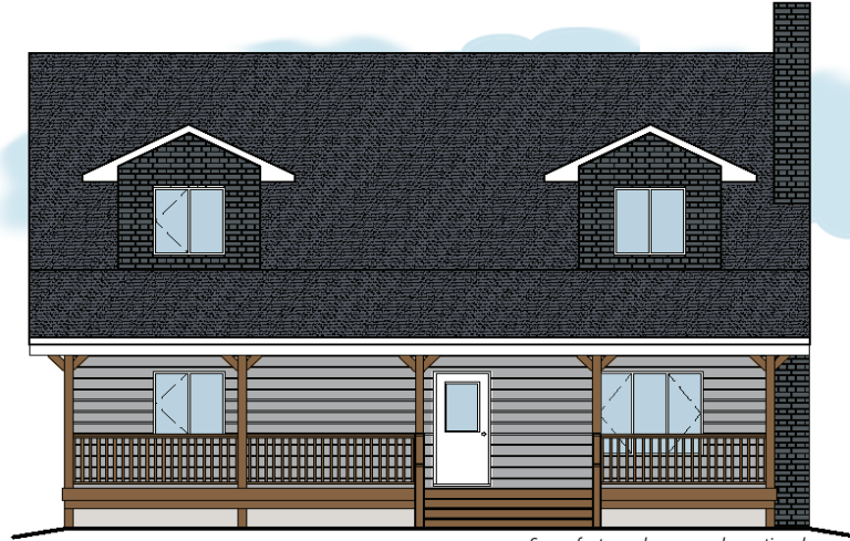
Some features shown may be optional